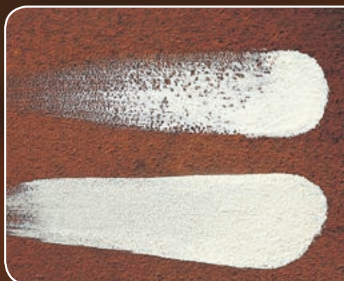
Photo compares one brush stroke of quality primer (top), with one stroke of the same primer mixed with Owatrol® Oil. The difference is what makes Owatrol® Oil. such a success as a quality paint conditioner.

Owatrol® Oil gives better results with wood and metal primers: