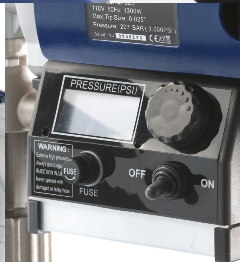
Easy-read digital display

Igoe International Ltd 135 Slaney Road, Dublin Industrial Estate Glasnevin, Dublin 11, Ireland Tel 01 830 2250 / 2599 Email info@igoe.ie www.igoe.ie